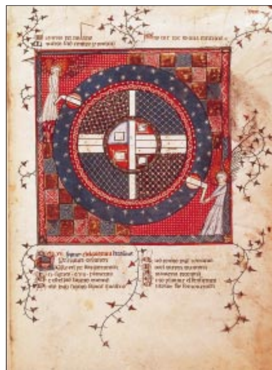
Angels make the universe turn—and time moves on

Of 3393 patients with a bloodstream infection, 1691 patients were randomised to the intervention group and 1702 to the control group. No patients were lost to