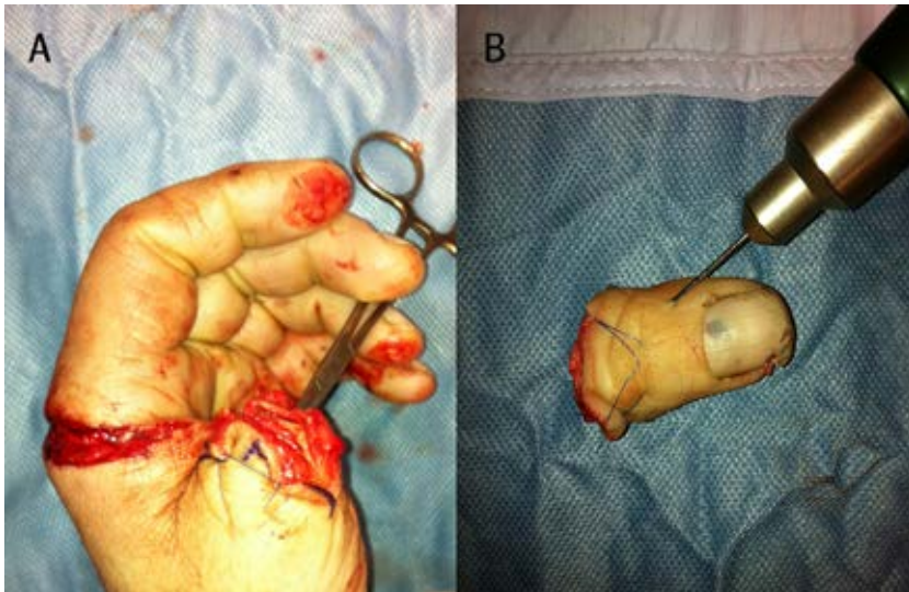
Fig 1 (A) Hand and (B) dominant left thumb of a 54 year old man amputated with a circular saw through the proximal phalanx. A Kirshner wire has been passed anterogradely into the bone of the amputate and will be used to fix the bone