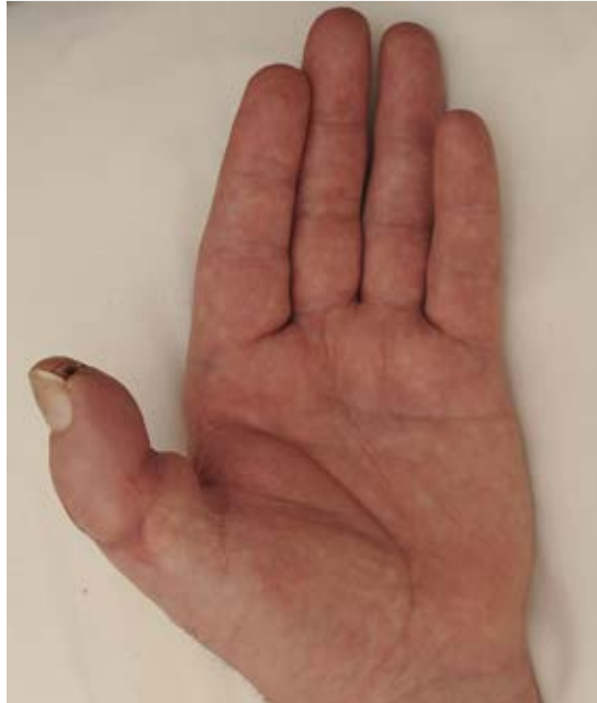
Fig 3 | The hand at eight weeks after replantation. The Kirshner wire was removed after four weeks