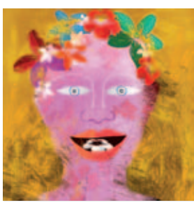
Metaphors for disease, p 31