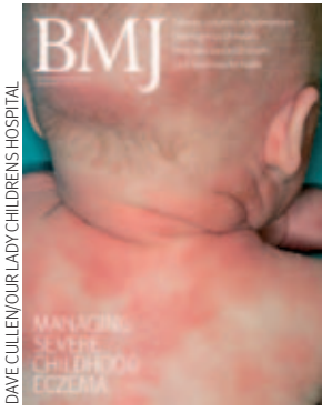
CLINICAL REVIEW, p 35