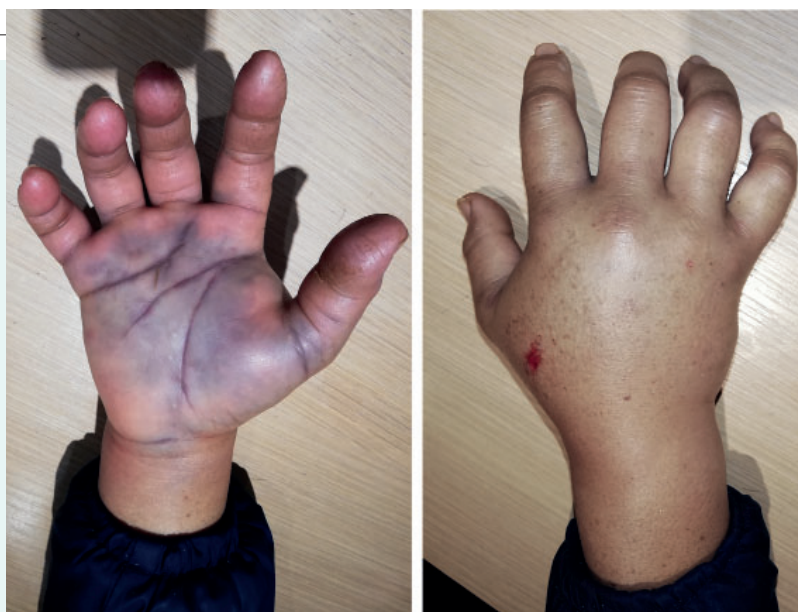
Clinical photos of the patient's right hand with extensive bruising of the palm (left) but not the back of the hand (right)