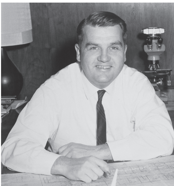
ST JUDE CHILDREN'S RESEARCH HOSPITAL