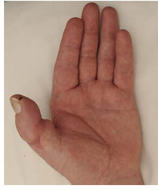
Fig 3 | The hand at eight weeks after replantation. The Kirshner wire was removed after four weeks